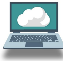
Fig: Cloud Services

Back in the old days, if you wanted to create a web application and deploy it to the web, you would need to purchase a hardware server. A server is necessary for running your web pages on the world wide web, so that when someone accesses your site from their computer using a browser (the client), a request can be sent to your server and return the web page back to the user's client. However, purchasing these servers were expensive and inefficient, because if, for example, you only needed the computing power provided by one and a half servers, you would still need to purchase two servers. These costs were prohibitively expensive for most people who now have access to cheap computing power via cloud services.