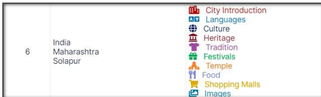
Figure 4: Admin Panel to add all Information