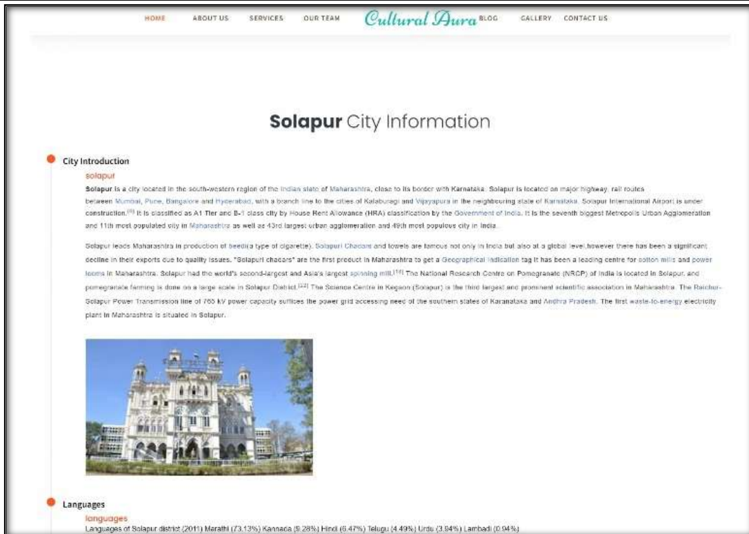
Figure 3: Sample Information for User