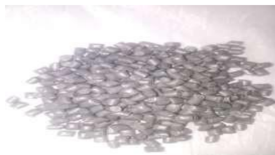
Fig 2: Recycled plastic pellets