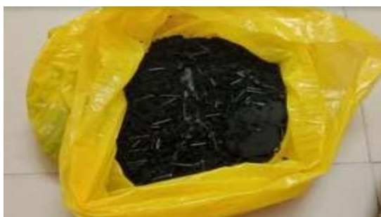
Fig 1: Industrial rubber waste

Prior to the use in the experiment, basic tests were carried out to determine the properties and behavior of the rubber. Tests carried out are Specific gravity test - 0.52 and Bulk Density of rubber - 360.6 kg/m 3 .