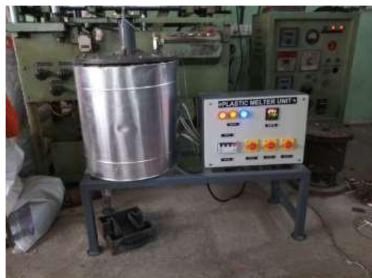
Fig 3: Portable plastic melter

For this study, a simple and small plastic melting machine was designed. As the machines used in recycling industry for melting plastic is way bigger and it cannot be a mobile machine. A small machine compared to industrial machine was designed A cylindrical container, one indicator box is cladded on the top. The cylindrical container of diameter 250-300 mm and height of 300-450mm has an inlet of diameter 30-40mm at the top, through which the plastic material is poured and an outlet at the bottom of the container to which can be controlled by a valve to collect the melted material. The heat inside the container can be regulated by opening the pressure valve, this allows the fume out of the container. An electrical box is placed beside the container which has a power switch, three regulators for the three different coils placed inside the cylindrical container and their temperature can be altered by a temperature indicator. The container has a capacity of holding 10-12 kilograms of plastic in it and the temperature can be varied up to 850-900° C. The equipments works with three phase power supply, which is connected to electrical box and coils.