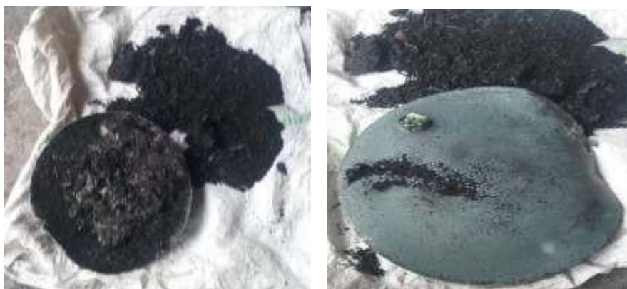
Fig 7: Uneven mixture of plastic and rubber

The combination of plastic and rubber waste was a failure, as plastic and rubber did not form a homogenous mixture.