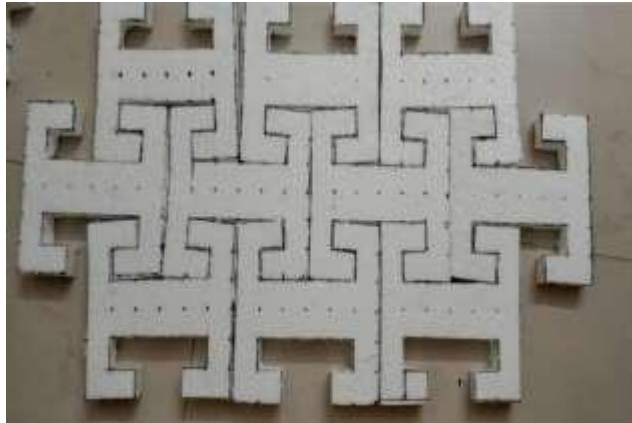
Fig 6: Model of interlocking system