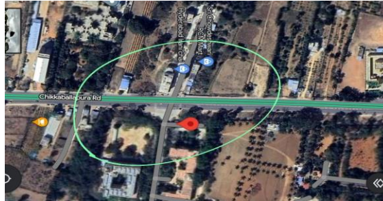
Figure 4: Damaged Street Light finding Location

Figure 4 shows the location of the damaged light. The indicator indicates the exact location.