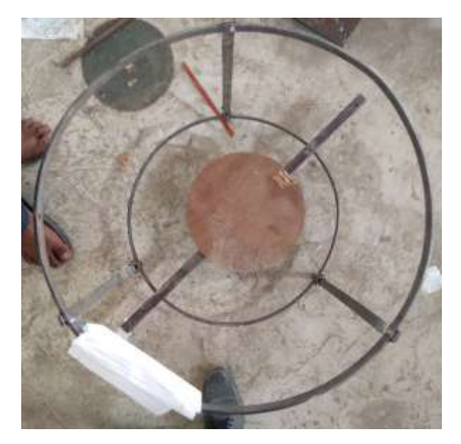
Fig-1: Base Frame

The materials of base frame is mild steel and the wood. At the base frame we are situated the bucket or any parts which is containing the water and detergent and dirty clothes. The radius of the base frame is 12 inches and the heights of the base frame is 30 inches. The three legs of wooden is rotates in the bucket which is situated on the base frame. The base frame shown in figure 1.