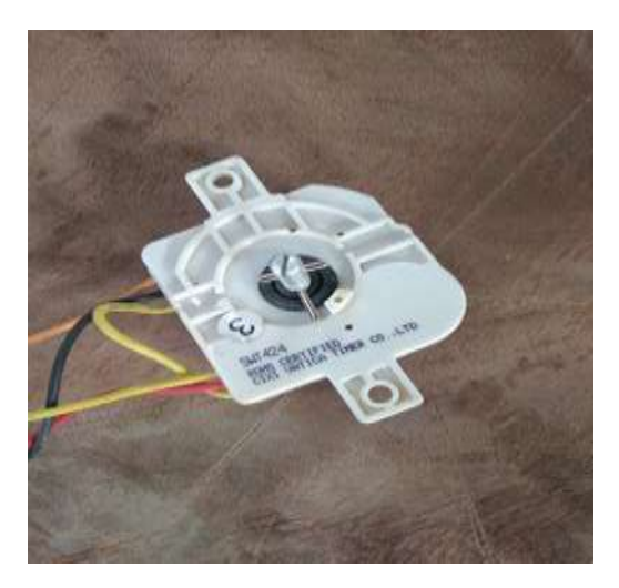
Fig-2: Motor control circuit

The timer on your washing machine contains a variety of small parts that can keep your appliance from operating properly, if instance, a rotating camshaft within the washer activates individual contacts it open and closed these contacts for powering the next washing cycle.