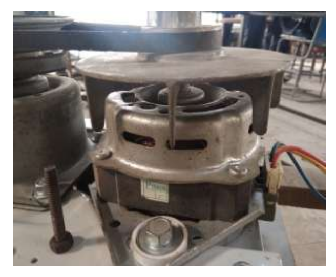
Fig-4: Induction motor

An induction motor can therefore be made without electric connections to the rotor. Induction motor shown in above fig -4, it is three phase induction motor. This motor is rotate clockwise direction and anti-clockwise direction through the timer, the timer plays an important role for rotating the motor. Motor voltage: 220 volt Speed: 1325 rpm.