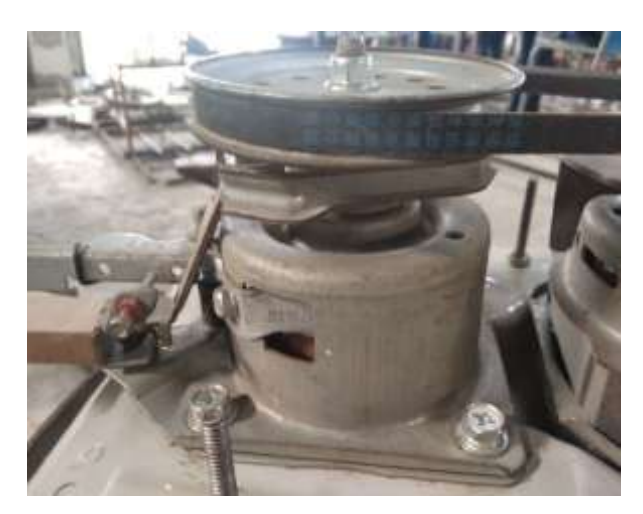
Fig-3: Speed reducer

Application specific types to customized specific solution types including of Helical worm motor gear reducer, parallel shaft helical gear reducer, and helical reduction gear box.